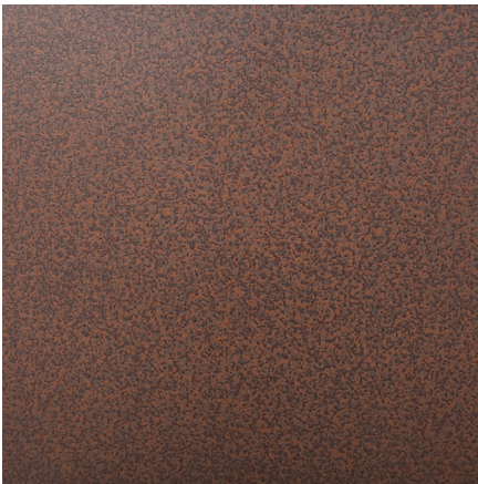
Rustic Ridge SRI-28