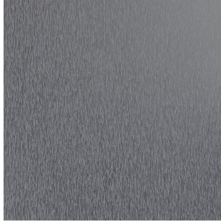
Titanium Grey SRI-32