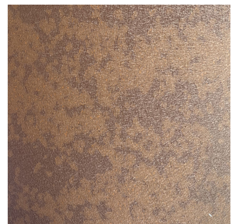
Rustic Rawhide SRI-32 *In Stock

Important Notes: Painted products are coated on an individual paint run basis. As such, the customer is required to take 100% yield of the coil paint run in Flat Sheets, Coil or Panels. Prices VARY based on QUANTITY, coil width and gauge. Due to width restrictions of the specialty coil - Not all Taylor Products are available in their original sizes or configurations. All information stated in the color guide is correct at the time of print and subject to change without notice. Please contact your sale manger for details and restrictions.