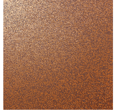
Metallic Rust SRI-35