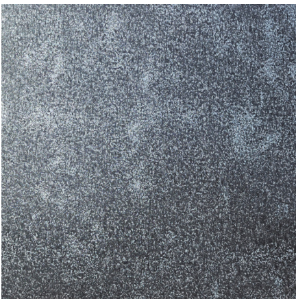
Midnight Hour SRI-32