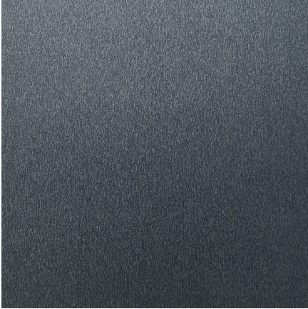
Black Ore Matte SRI-27